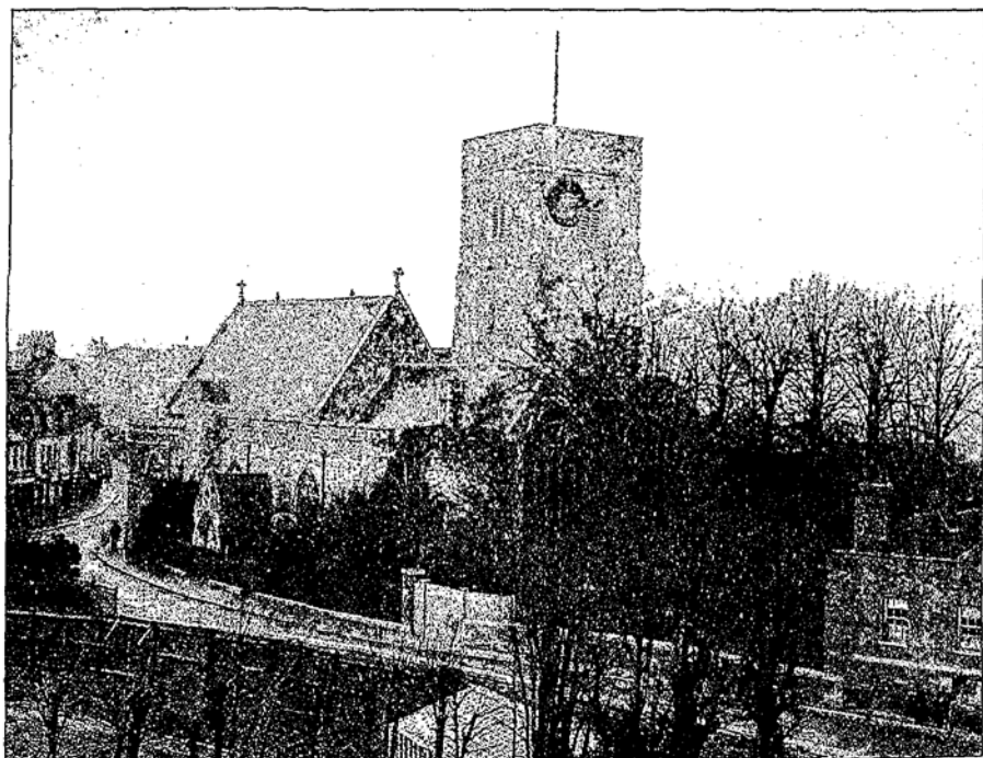
DARTFORD CHURCH, No. 1; FROM THE SOUTH-EAST.