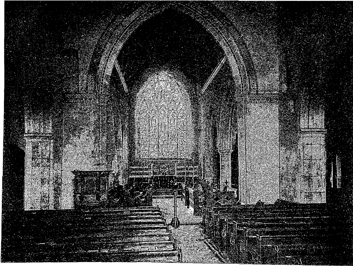
DARTFORD CHURCH, No. 3.